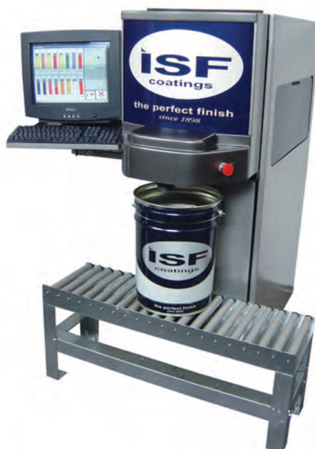
ISF's Automatic ON-Site Promatch System